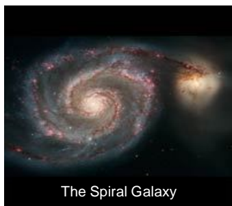
The Spiral Galaxy